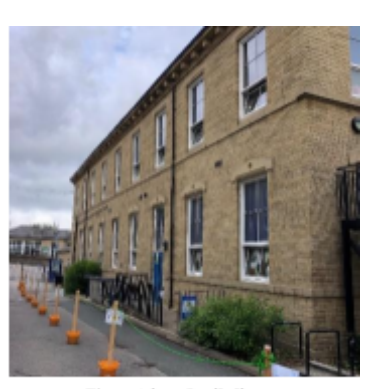
The Aire Building

When arriving via the main gate, the smaller building to the left is The Salt Building and the larger building to the right is The Aire Building . Key Stage 2 children are based in The Aire Building.