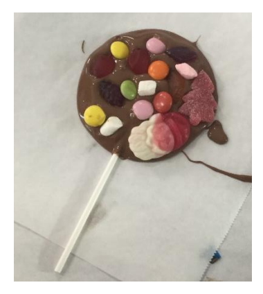
Year Two's chocolate making workshop